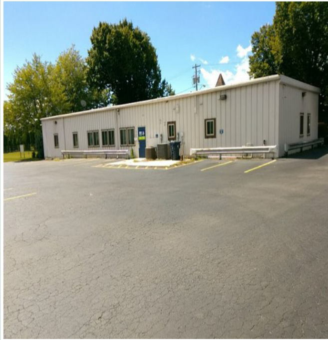
Office- 4,480 SF

Industrial/Warehouse 17,500 SF to 73,000 SF 400 Ingham Ave, Lackawanna, NY 14218