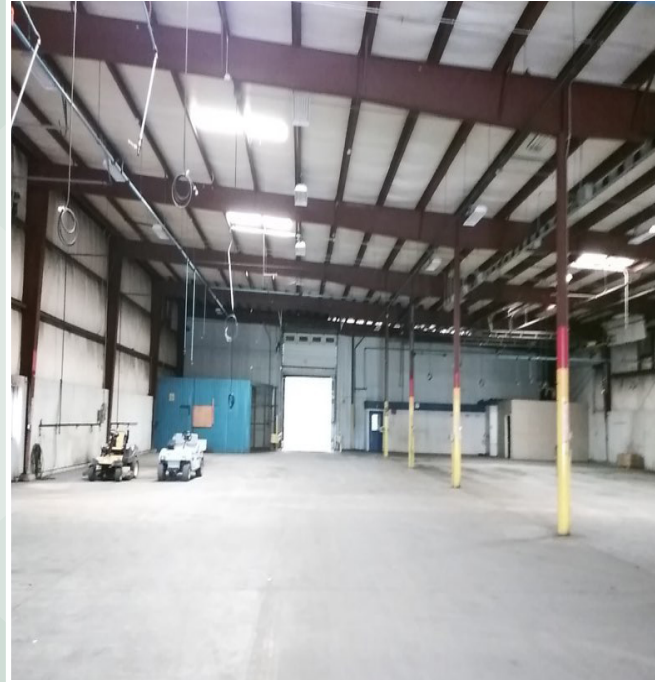
Manufacturing- 17,500 SF