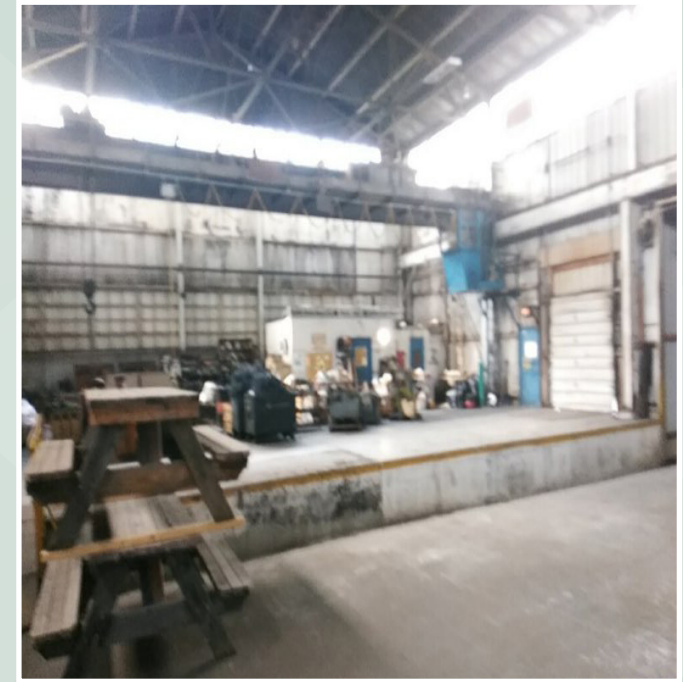
Crane Way 10 Ton- 15,600 SF